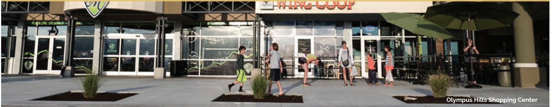
Olympus Hills Shopping Center

"MILLCREEK'S ECONOMIC DIVERSITY THRIVES BY BEING INVITING, SUPPORTING LOCAL BUSINESSES, ATTRACTING AN INNOVATIVE AND ADAPTIVE WORKFORCE, INVESTING IN AMENITIES THAT PROMOTE A BETTER QUALITY OF LIFE, AND ENCOURAGING A RANGE OF BUSINESS SIZES AND TYPES."